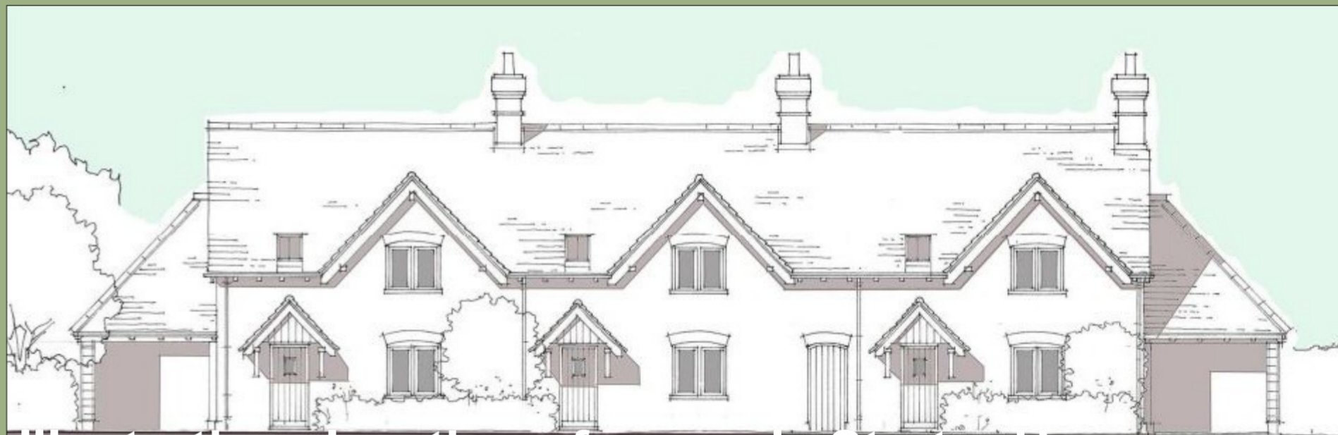
Illustrative elevation of example Starter Homes